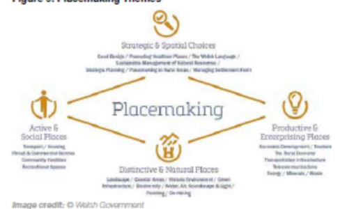
Figure 9: Placemaking Themes

<sup>25</sup> Good Design and the Local Development Plan Process, DCIW, 2014.